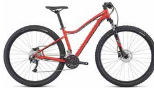
Specialized Jett Sport