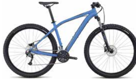
Specialized Rockhopper Sport